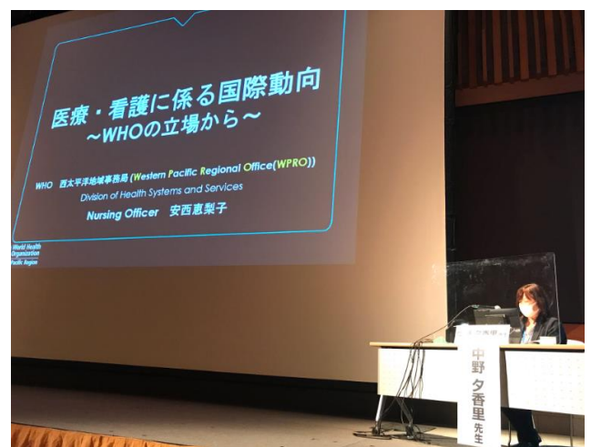
Seminar: Global Trends in Healthcare and Nursing